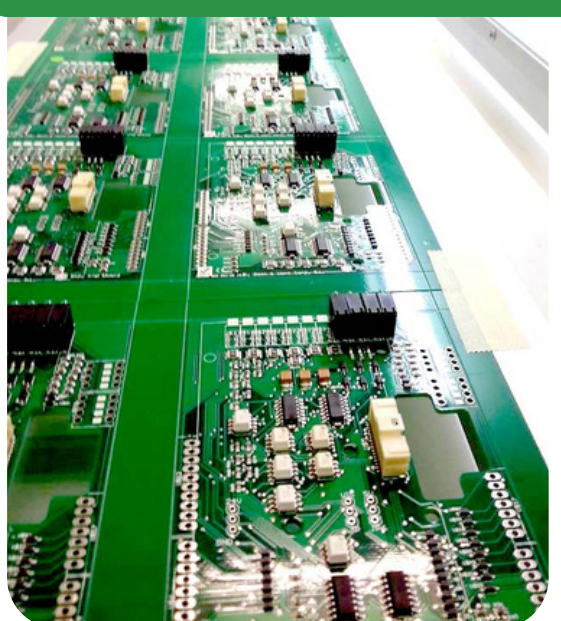
Bigdata Cloud Computing Flexible Hardware Industrial Internet of Things

Boot & Work Corp. S.L. is a company committed to the promotion, development, manufacture and sale of products based on Open Source technology to liberalise the industrial sector and boost the growth of its customers.